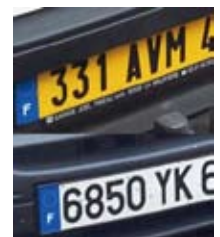
Image cropping, people counting, object tracking, tampering detection and exposure modification of portions of a video picture also are possible. Some surveillance cameras include metadata about what is shown in the video, provide the time and date when the video was recorded, and perform facial and license plate recognition, to name a few.

Of course, how smart a camera has to be is a function of each individual application. Still, having intelligence in the camera – that is, at the edge – enables quick set up without heavy reliance on network resources. Cameras do not need to have expanded intelligence inside, however. Intelligence can also reside in encoders in the case of analogs, in storage devices and through analytics software in video management systems.