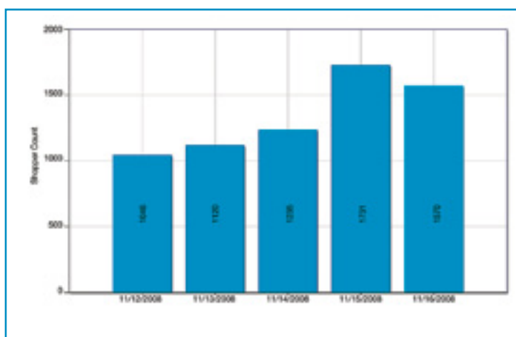
This chart depicts a shopper count for the entire store. Retailers can analyse store traffic and value to better optimise their workforces and appropriately align staff across departments.

Nextiva Retail Traffic Analytics can help retailers see how customer volume varies from day to day, week to week, and month to month; how volume is impacted by time of day; and how volume changes on weekends and holidays.