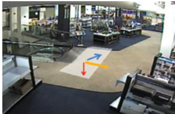
Nextiva Retail Traffic Analytics can show businesses traffic patterns, including the direction in which people move through their stores.