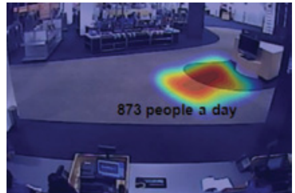
Nextiva Retail Traffic Analytics can highlight high-traffic "hot spots." In this case, the picture showcases an area that attracted more than 800.